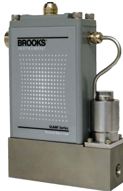
Brooks® SLAMf Series with Profibus Communications