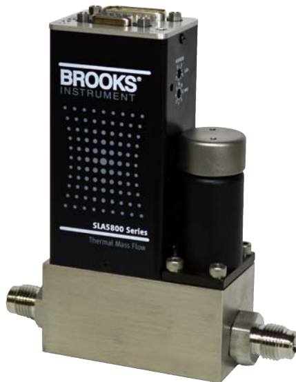
Brooks® SLA5800 Series with Profibus Communications